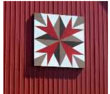
12. Welcome Home 10302 W. Cedar Wapsie Road, Cedar Falls