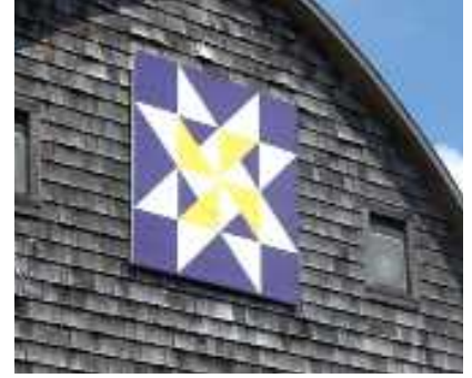
10. 8 Point Star One Clucking Hen (on wagon) 5532 N. Union Road, Cedar Falls