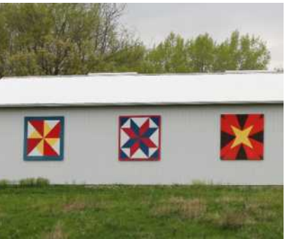
14. Whirlwind, 8 Point Star, 4 Point Star Modified 6804 Fitkin Road, Cedar Falls

The Story ~ Wayne and Maxine Fitkin are the owners of this Century Farm. Wayne and his sons, Steve and Jim, farm the land and wanted to honor those family members who farmed the land before them by making the three barn quilts. "Our 1950 barn burned in 1996 so we built a pole barn and a hay barn. The three quilts are hanging on the south side of the hay barn. The first block is a Pinwheel design in red, yellow, blue, and white. The middle block is a patriotic eight-point star in red, white, and blue. The third block is a modified four-point star in yellow, orange, and brown. It was an enjoyable project for them to work on during the winter." ~ Wayne & Maxine Fitkin