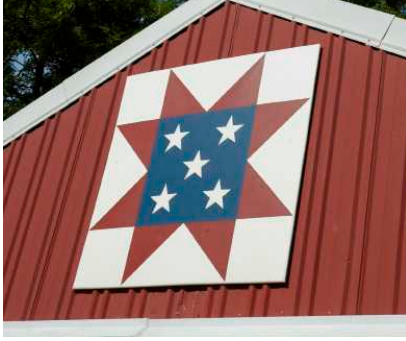
8. Sawtooth Star 3121 Jepsen Road, Cedar Falls