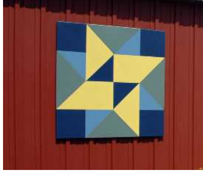
9. Mosaic Patch 8532 Westbrook Road, Cedar Falls